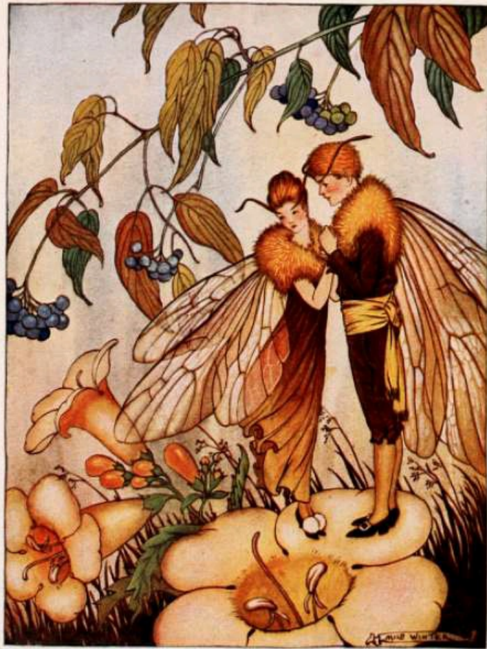
"Nuova, I love you" (page 140)