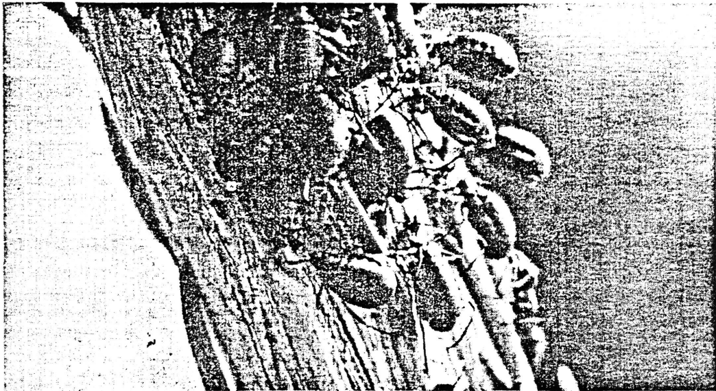
FIG. 1. A group of the greater black spruce bark aphid, Cinara piceae (Panzer), producing honeydew on the terminal shoot of spruce ( Picea abies ). This aphid is an important producer of honeydew flows in the higher Alpine forests.