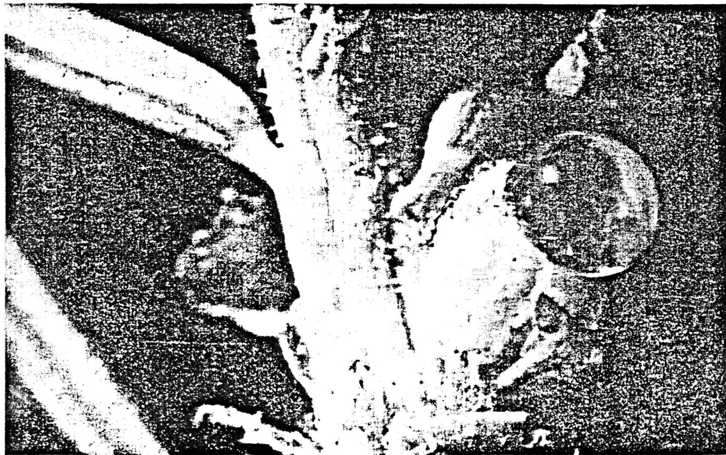
FIG. 2. Production of honeydew by a small spruce scale insect ( Physokermes hemicryphus Dalman) on a spruce stem. The insect is well camouflaged by its habit of attaching itself to the stem between bud scales. It is covered with wax threads and hardly looks like an insect at all. Here a young female is shown with the drop of honeydew she has excreted: the bees collect these drops directly from the insect.