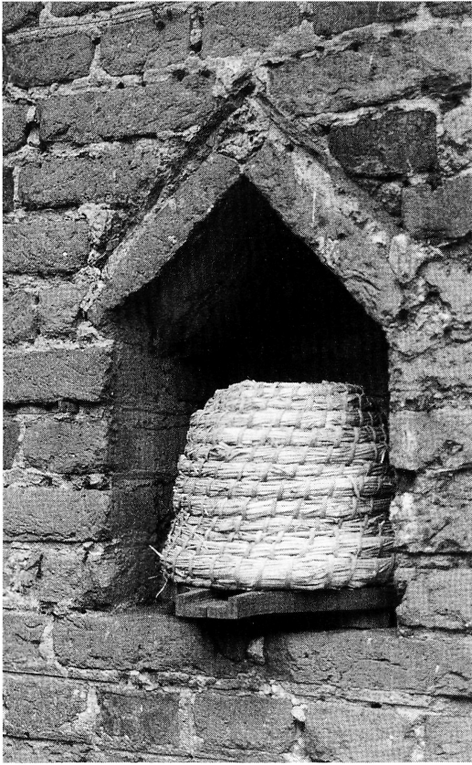
Figure 11. A hive recess in a brick wall with a straw skep on a wooden base at Quebec House, Westerham in Kent. IBRA Register, no. 78.

Over half the walls with hive recesses can be dated precisely or at least to a specific century, and the peak of building activity in England seems to have been during the seventeenth and eighteenth centuries. The earliest stone wall on the Register, probably built in the twelfth century, was in a garden at Buckfast Abbey, Devon (see below). Several brick walls in Kent are early; for instance, a 1490 garden wall in Canterbury has three recesses on one side and twenty on the other. 31