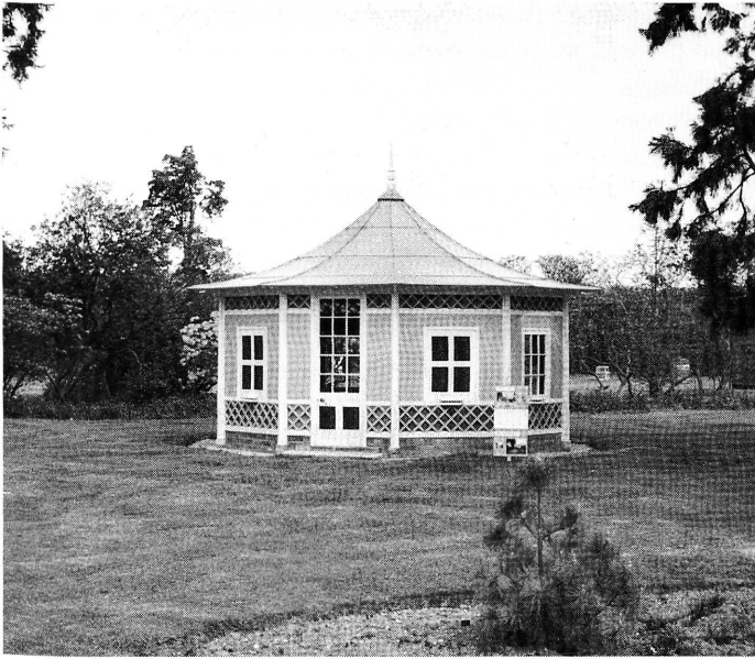
Figure 14. The bee house at Hall Place (now the College of Agriculture), Burchetts Green, Maidenhead in Berkshire, reconstructed in 1976. IBRA Register, no. 621.