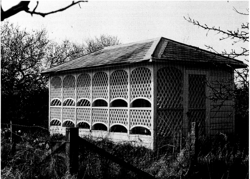
Figure 15. The bee house at Attingham Park, Atcham in Shropshire, restored in the 1960s. IBRA Register, no. 46. Photo: Natalie Hodgson, 1974.