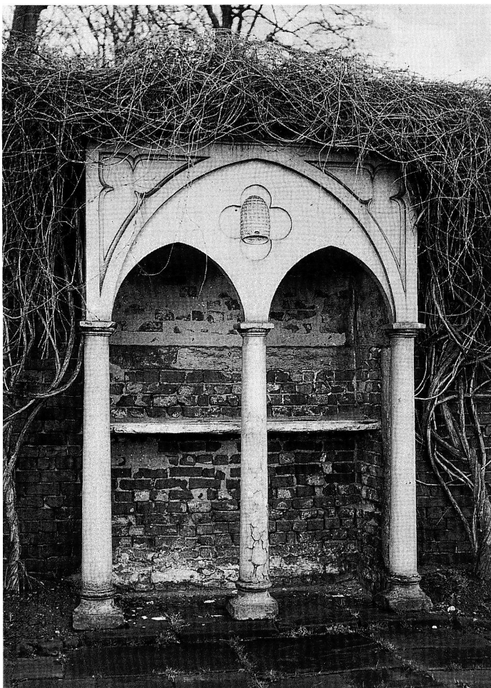
Figure 13. An alcove for skeps at Daresbury Hall, Daresbury in Cheshire. IBRA Register, no. 16.